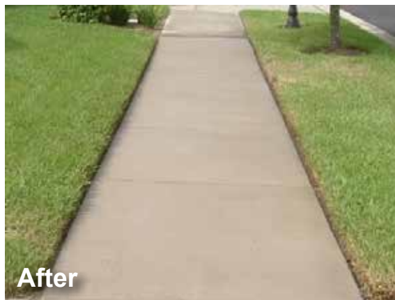
These sidewalks near a newly built home were stained by rusty well water. The filter system couldn't keep up with the amount of water used for the new sod. A double application of OneRestore was spaced 3-5 minutes apart without rinsing in between.