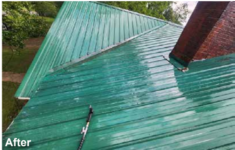
This contractor from Walnut Grove, Alabama used 2 applications of OneRestore to remove the heavy rust stains from this metal roof. With no scrubbing, the stains melted away.